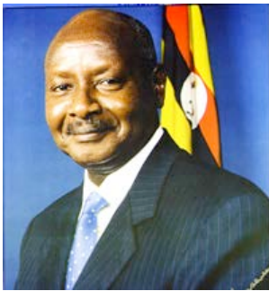
President Yoweri Museveni

Uganda became an independent country in October 1962 with Milton Obote as Executive Prime Minister. Two decades of military coups and counter-coups followed, during which millions fled the country and over a million people were murdered. The most infamous dictatorship was that of Idi Amin, who seized power in 1971 and for over a decade presided over massive human rights abuses and economic decline. (Among other things, he cast the Indian minority out of Uganda, which resulted in long-lasting damage to the Ugandan economy). Amin's rule ended after his troops invaded Tanzania in 1979. The Tanzanian military repulsed the incursion, and ousted Amin from power. A second brutal Obote regime followed, until he was unseated by the military general Tito Okello in 1985.